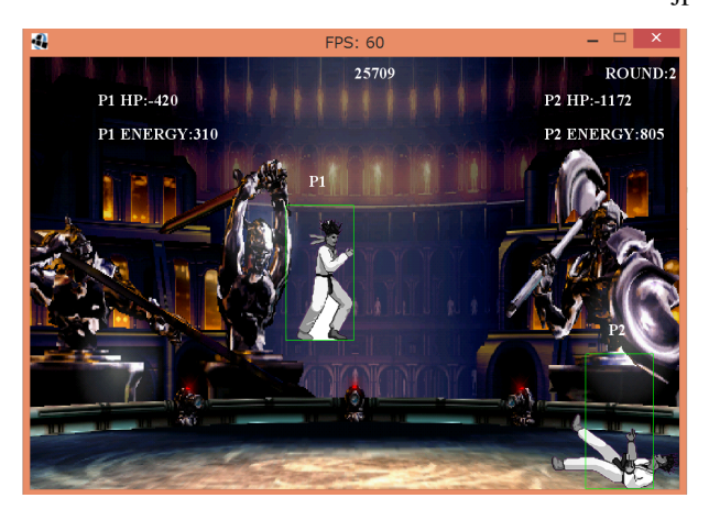
Fig. 1. Screen-shot of FightingICE where both sides use the same character from the 2013 competition.

However, most of the existing AIs are rule-based ones, where their actions are merely determined by various attributes of the game, such as the characters' coordinates or damage amounts. Such rule-based actions may unwittingly lead to their AI being hit by the player and thus taking damages. As a rule-based AI repeatedly employs the same pattern, it will employ the same action, even if that tactic has been proven ineffective against the player, whenever the same condition arises. Thus, if its opponent player intentionally reproduces the same condition, the AI will repeatedly employ the same ineffective tactic.